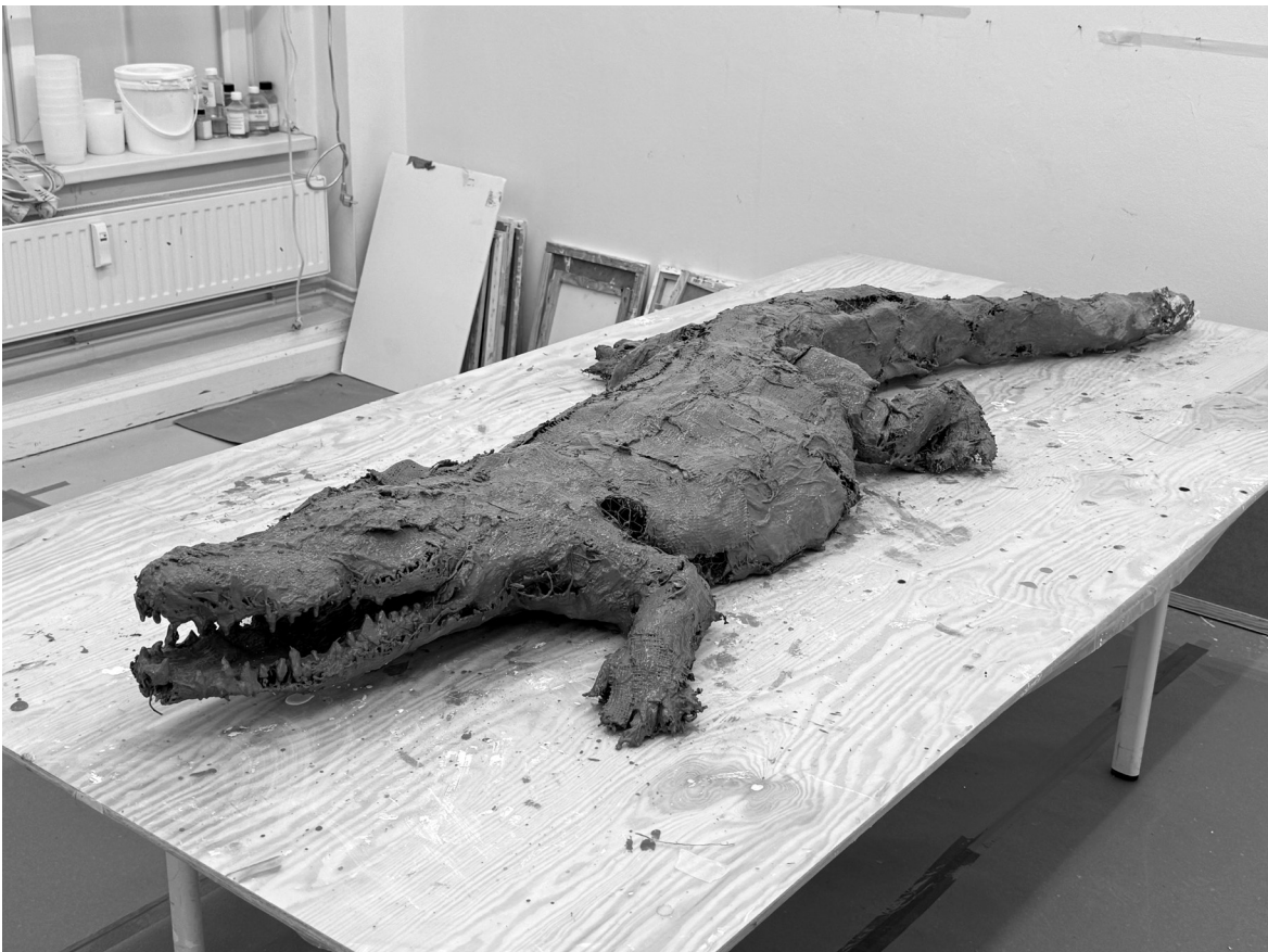
The earliest Crocodylian, circa 95 million years ago, 2024

million years ago, approximately 83.5 million years ago, and 2,000 years ago. The crocodiles appear at once naturalistic and artificial, bearing processual traces of their physical becoming, a state they can be said to still inhabit. Despite their status as models, they also retain a dormant wildness, characteristic of the archaic predators they are – simultaneously threatening and threatened. In the crocodiles, the movement from past to present is short-circuited, and another, slower temporal horizon is introduced, contrasting with the 24/7 non-time of today.